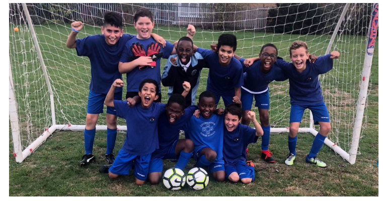
Our year 5/6 Goalball team enjoy celebrating two wins a row. Well done to you all.

We are having 30 Y5/6 pupils trained as sports leaders starting this term and they'll be coaching and running competitions. Also we have ordered full size football goals for 9-a-side and have marked the pitch. We hope to have that up and running very soon.